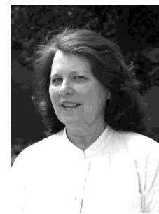
Member-at-Large 2201- 5500