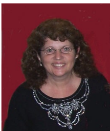
VCCA/CSLA Scholarship Winner