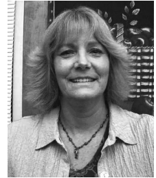
Member-at-Large 1501- 2201

the VCCA offers as well as the networking opportunities, travel, and meeting fellow members from other community colleges in Virginia. She would very much like to keep contributing to the VCCA, by serving as Member-At-Large on the Executive Committee.